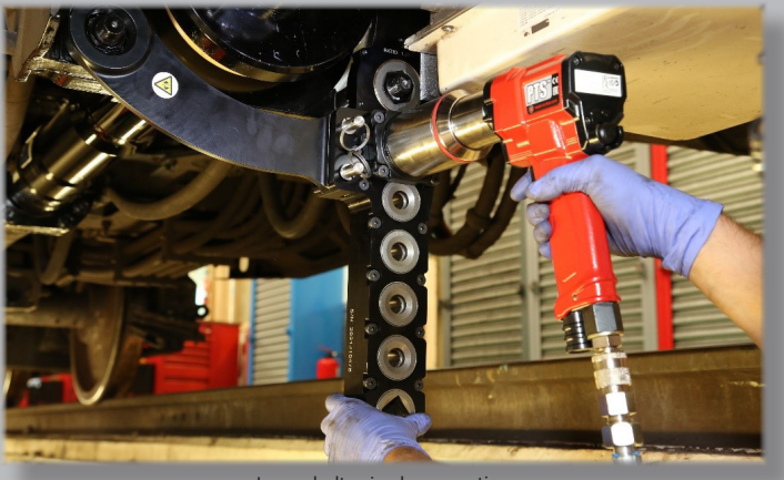
Lower bolt using long reaction

As part of the quotation process, a 3D printed model of the offset was created to ensure that the final product would reach all of the bolts intended for it. The value of this was proven when it was discovered that the first printed model did not in fact fit all couplers. Modifications were subsequently made to the design prior to manufacture.